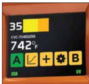
Tip temperature displayed on large color screen.