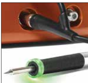
LED equipped hand piece signals to operator when a good solder joint is formed.