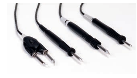
MFR-1100 Series Hand-pieces A. MFR-H4-TW Precision Tweezers B. MFR-H6-SSC SSC Soldering Cartridge C. MFR-H2-ST Soldering Tip D. MFR-H1-SC Soldering Cartridge